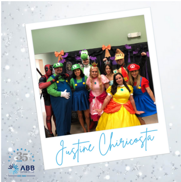
ABB team members reflect on some of their most favorite memories. Join the fun and share your own stories at momentmaker@abboptical.com .